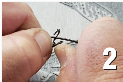
Photo 2. Gently squeeze the snap with your right thumb on the bottom and your right index finger against the top of the snap. While you push upward on the snap, at the same time use your left

thumb to push the circle away from your body.