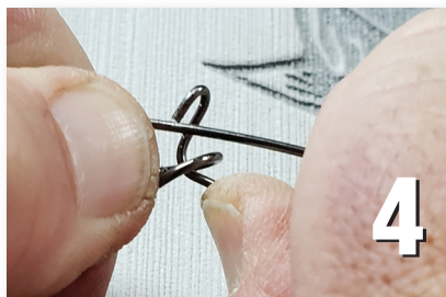
Photo 4. Now, to close the snap, you

Photo 3. As you push the hook upward and off the wire, keep pressure against the circle with your left thumb allowing the hook end of the snap to lower out of the circle portion of the snap. Now your snap is open.